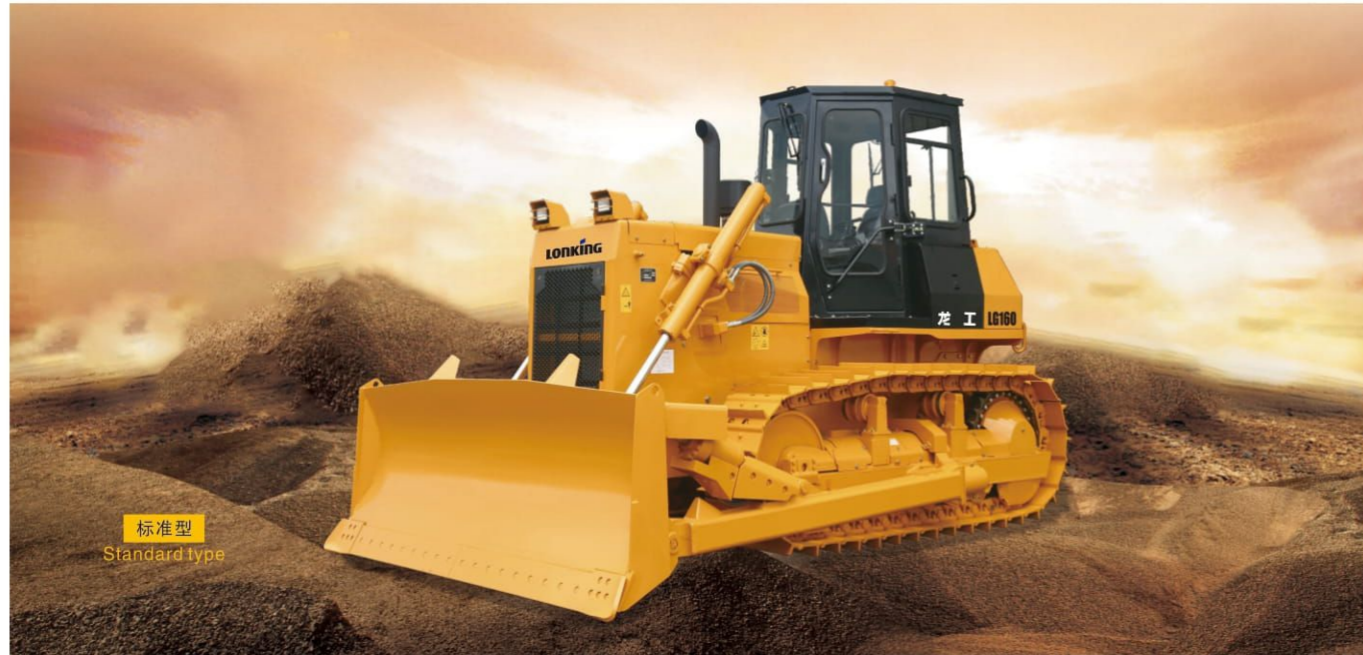
标准型 Standard type